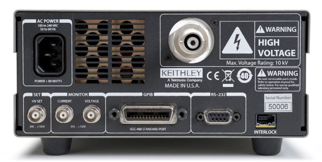
2290-10 rear panel showing the IEEE-488 interface connector, RS-232 interface connector, high voltage output connector, analog control/output connectors, and interlock connector.

The Series 2290's IEEE-488 interface allows the creation of an automated high voltage test system. Software drivers are supplied to simplify and accelerate test system development. This further enhances safety as the high voltage can be controlled from a remote location.