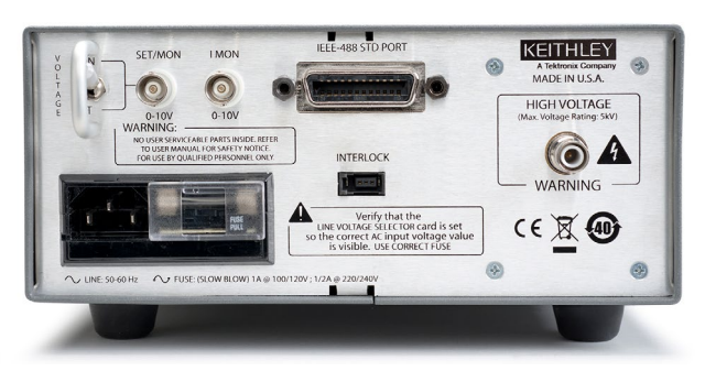
2290-5 rear panel showing the IEEE-488 interface connector, high voltage output connector, analog control/output connectors, and interlock connector.

Use a sensitive Keithley measurement instrument, such as a Keithley SourceMeter® SMU instrument, to measure current drawn by the device under test (DUT) that is below the sensitivity of the Series 2290 Power Supplies. Keithley SourceMeter SMU instruments can provide sensitivity as low as 0.1fA. The following diagram shows how the 2290-PM-200 Protection Module protects the low voltage SourceMeter SMU instrument from high voltages